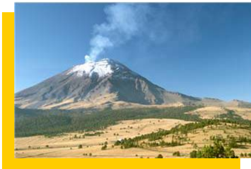
Plate tectonics is a unifying geologic theory that explains the formation of major features of Earth's surface and important geologic events. Sixth-grade students learn about the evidence of past plate tectonic movement and about landforms and topographic features—such as volcanoes, mountains, valleys, and mid-ocean ridges—generated by plate movement. They discover that major geologic events, such as earthquakes, volcanic eruptions, and mountain building, result from plate movement and often occur at the boundaries of the plates.

Students also learn that Earth is composed of three distinct layers: the lithosphere, the mantle, and the core. They understand that the flow of heat and material within Earth drive the movement of lithospheric plates, and they apply an understanding of plate tectonics to explain the major features of California geology.